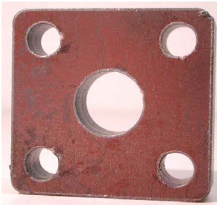
Fig. 2: Bysoft 6.7